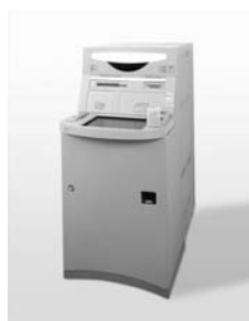
Fig.5. ATM with palm vein pattern authentication sensor unit

Fujitsu palm vein authentication technology offers contactless authentication and provides a hygienic and non-invasive solution, thus promoting a high-level of user acceptance. Fujitsu believes that a vein print is extremely difficult to forge and therefore contributes to a high level of security, because the technology measures hemoglobin flow through veins internal to the body. The opportunities to implement palm vein technology span a wide range of applications.