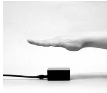
Fig. 4. Palm vein sensor