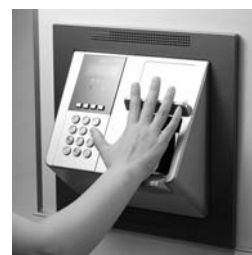
Fig.7. Palm vein access control unit