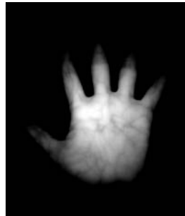
Fig. 2. Infrared ray image