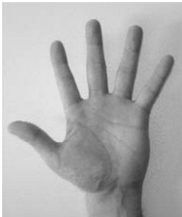
Fig. 1. Visible ray image

The deoxidized hemoglobin in the vein vessels absorb light having a wavelength of about 7.6 \times 10^{-4} mm within the near-infrared area [2]. When the infrared ray image is captured, unlike the image seen in Fig.1, only the blood vessel pattern containing the deoxidized hemoglobin is visible as a series of dark lines (Fig.2). Based on this feature, the vein authentication device translates the black lines of the infrared ray image as the blood vessel pattern of the palm (Fig. 3), and then matches it with the previously registered blood vessel pattern of the individual.